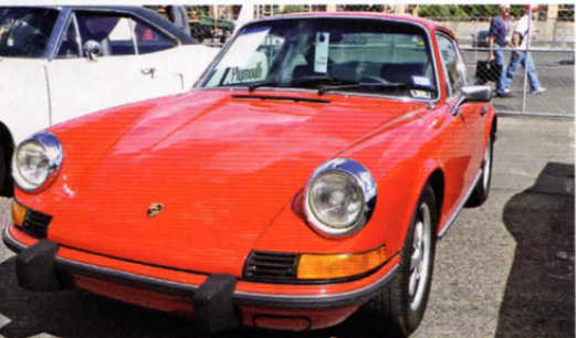
1973 Porsche 911S coupe, sold at $116,000

This was an important sale for Russo and Steele, which has in the past focused on Scottsdale and Monterey, and these results were solid for an all-new event. I'm sure we'll see Russo here again in the future, and I'm willing to bet we'll be seeing even better numbers when they return. ♦