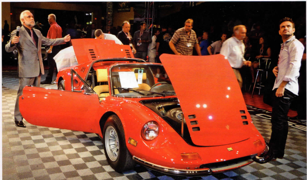
1974 Ferrari 246 GTS Dino Spyder, sold at $321,750

A red 1974 Ferrari 246 GTS Dino sold for $322k, followed by a 1967 Shelby GT500 Super Snake at $130k and a Bahia Red 1973 Porsche 911S at $116k